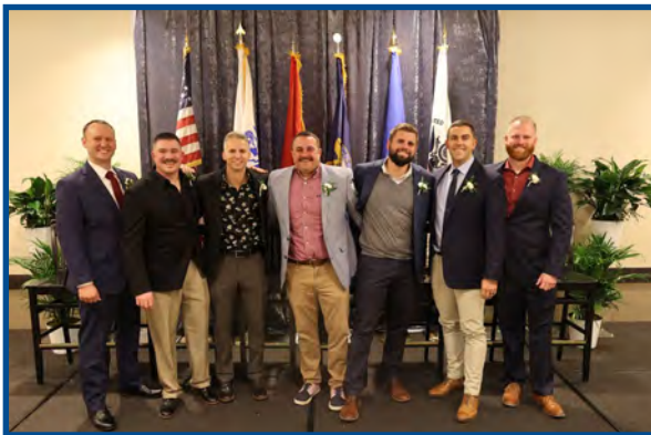
Members of the Class of 2006 honored at the Spirit of MVL Gala 2022 last November.

The blessings continue to flow! These past months have reminded me of this. The Spirit of MVL Gala 2022 was one such reminder. We welcomed seven members from the Class of 2006. The Lord led all these men into the military path. When these alumni were addressing the crowd, they were asked, "Is there anything you'd like to say to your parents and the supporters here tonight?" The response that came up again and again was, "Thank you Mom and Dad for giving me MVL". Those in attendance found it very moving. There weren't many dry eyes in the place with those heartfelt declarations!